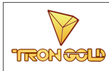
Lanny Been: Trading