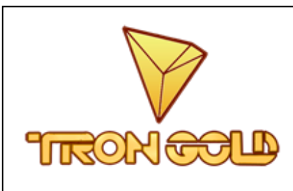
Stivin Loke: Trading